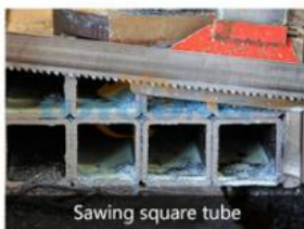
Sawing square tube