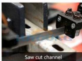
Saw cut channel