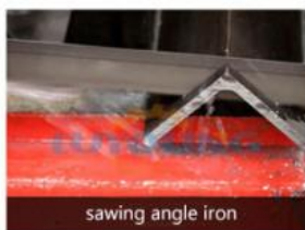
sawing angle iron

A VARIETY OF MATERIALS CAN BE ARBITRARILY CUT