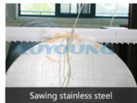
Sawing stainless steel