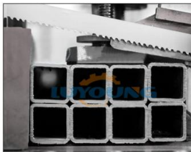
Cutting square tube