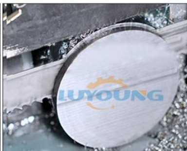
Cutting round steel