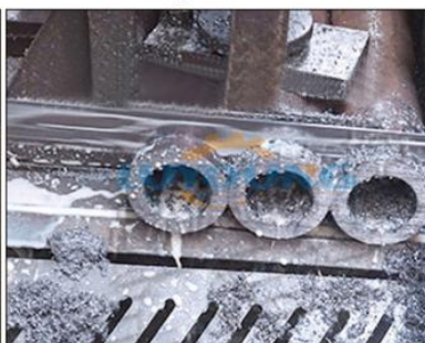
Cutting round bar