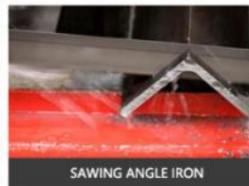
SAWING ANGLE IRON