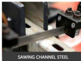
SAWING CHANNEL STEEL