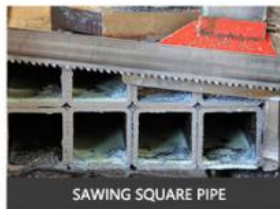
SAWING SQUARE PIPE