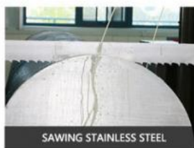
SAWING STAINLESS STEEL