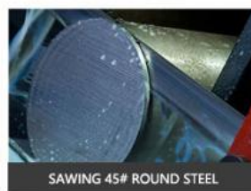
SAWING 45# ROUND STEEL