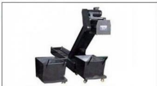
Chain Chip Conveyor