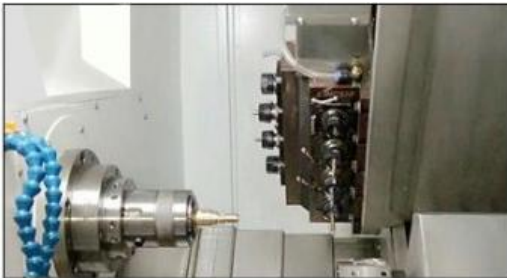
Y Axis And Power Head

Fanuc Cnc Slant Bed Lathe Machine tck6336 High Stability For Metal Industry ,It is suitable for rough and finishing machining of shafts, discs,sleeves and other mass production parts in industries such as automobiles, motorcycles, and compressors. It is especially suitable for heavy cutting and interrupted cutting. It can automatically complete the processing of various curved surfaces and threads such as cylinders, cones, arcs, etc., with complete functions and high cost performance.