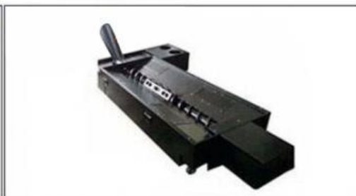
Spiral chip conveyor