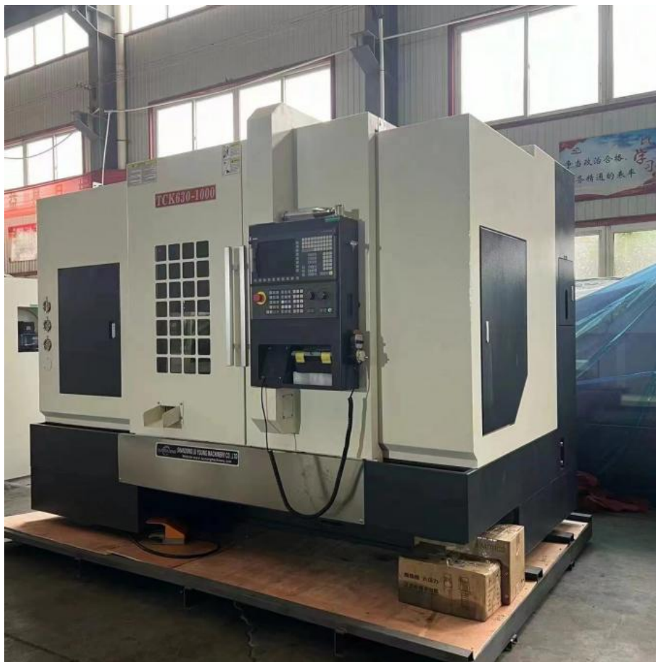
Specification of factory direct sales tck630 cnc lathe slant bed lathe machine for metal turning center tck 630