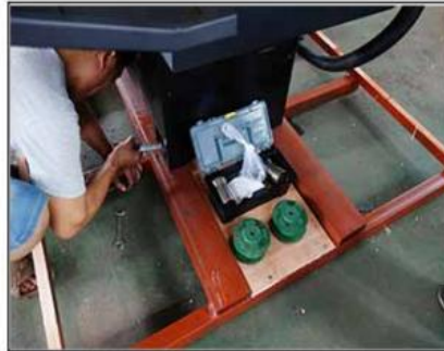
Steel plate, more stronger