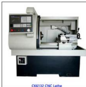
CK6132 CNC Lathe

CK6132 small cnc lathe FOB price:USD 7000-9000/set