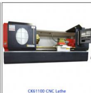
CK61100 CNC Lathe