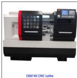
CK6140 CNC Lathe

CK6136 small cnc lathe FOB price: USD7500-15,000/set