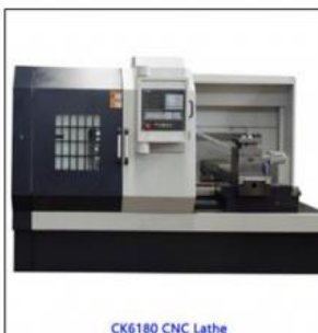
CK6180 CNC Lathe

CK6150 cnc lathe machine FOB price:USD 9000-25,000/set