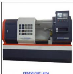
CK6150 CNC Lathe

CK6140 cnc lathe machine FOB price: USD8500-20,000/set