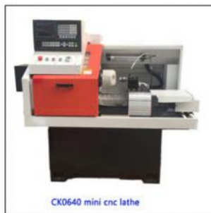
CK0640 mini cnc lathe machine