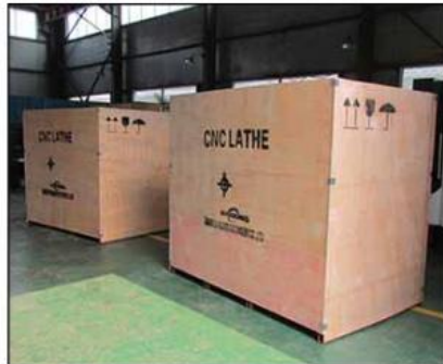
Fully sheathed case

Packaging information of factory direct sales tck630 cnc lathe slant bed lathe machine for metal turning center tck 630