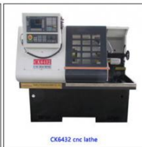
CK6432 small cnc lathe