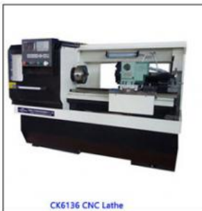
CK6136 CNC Lathe

CK6132 small cnc lathe FOB price:USD 7000-9000/set