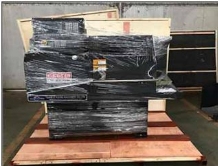
Water-proof and damp proof