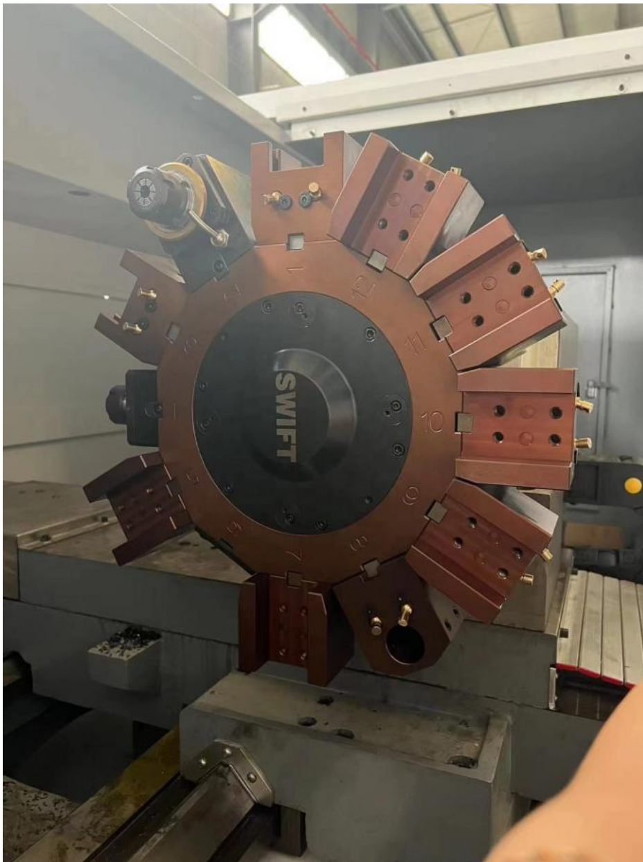
Other optional configuration of turret