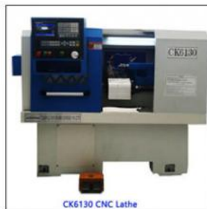
CK6130 small cnc lathe