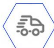
Delivery Time Promised

♥Training how to instal the machine, training how to use the machine.