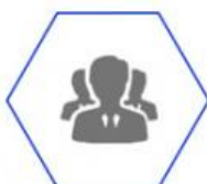
Professional After Sales Team