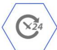
24 Hours On-line Service