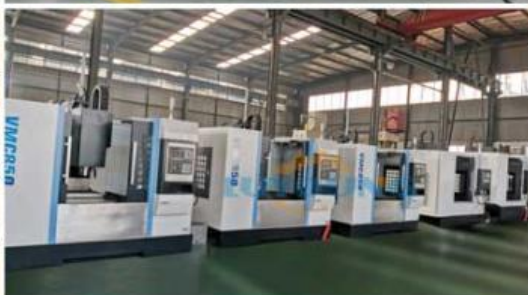
Packing & Delivery