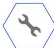
Installation and Commission Support