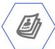
English User Manual and Operation Video