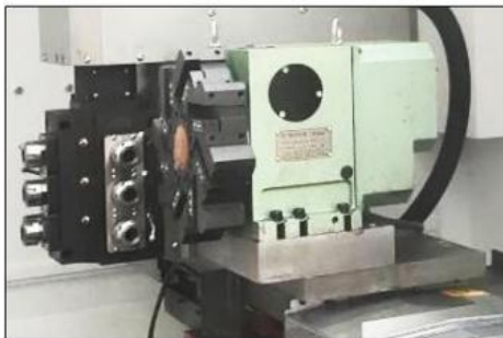
3+3 living tool