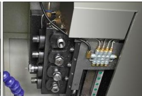
4+4 living tools

Specification of Universal TCK50 Mini Metal Lathe Horizontal Lathes driven turret lathes for metal with CE: