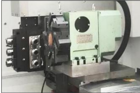
3+3 living tool