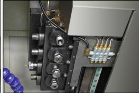
4+4 living tools

Specification of Slant Bed CNC Lathe Bar Feeder Mini CNC Lathe Machine Servo Turret With Turning TCK40 CNC hydraulic chuck hydraulic collet: