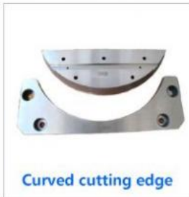
Curved cutting edge