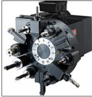
12station living turret