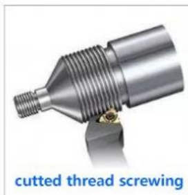
cutted thread screwing