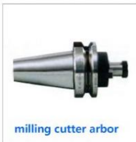
milling cutter arbor