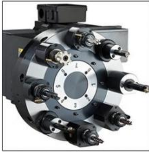
8station living turret