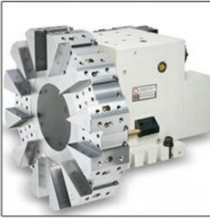
12station hydraulic turret