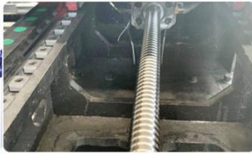
TAIWAN HIWIN LINIER GUIDEWAY & BALL SCREW