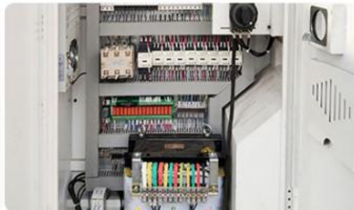
SCHNEIDER BRAND ELECTRICAL PARTS