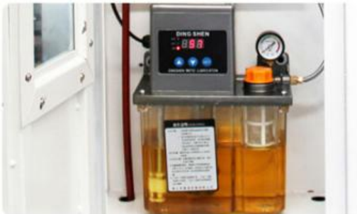
AUTOMATIC LUBRICATION SYSTEM