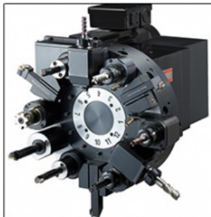
12station living turret