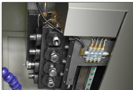
4+4 living tools