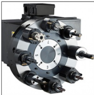
8station living turret