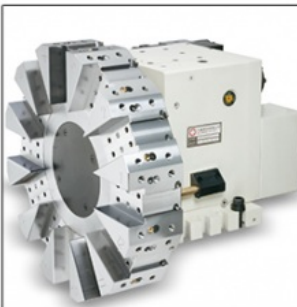
12station hydraulic turret