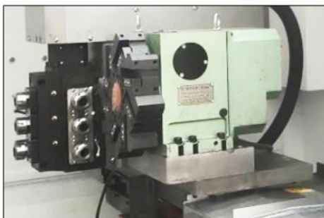
3+3 living tool